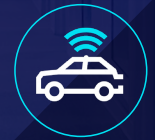
Users on the go