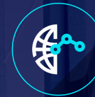
Across the country