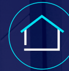
Users at home