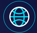
Across the globe

This has sparked the emergence of modern mobile and IoT applications to better serve customers and create new revenue streams.