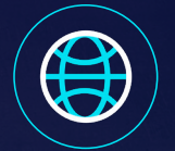
Across the globe

This has sparked the emergence of modern mobile and IoT applications to better serve customers and create new revenue streams.